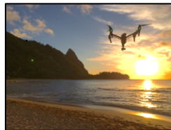
Aerial 4K Video and Photography